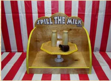
Spill The Milk 30"H x 23"W x 27"L

Carnival Game complete with game box, pedestal, 2 milk bottles and 2 flukey balls $285.00