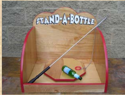
Stand a Bottle 30'h x 27"w x 23"d

Carnival Game complete with game platform & 16# regulation bowling ball $425.00