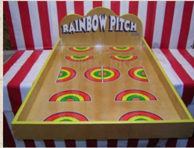
Rainbow Quarter Pitch 57"h x 10"d x 36"w Carnival Game complete with game board. Quarters not included. $345.00