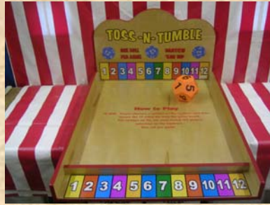
Toss n Tumble 24"H x 35"W x 48"L Carnival Game complete game & 12 sided die $365.00