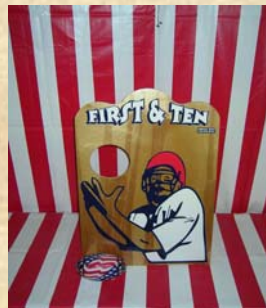
First and Ten 37"h x 23"w x 9"d

Carnival Game complete with game board and 3 bean bags $195.00