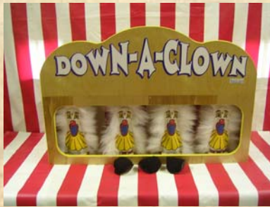
Down a Clown Knockdown Game Top Tier Carnival Game complete with 4- 14" Clowns & 3 Flukey Balls $450.00