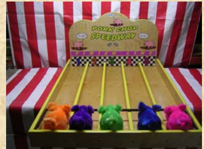
Pig Race 24"H x 35"W x 48"L

Carnival Game complete with game board and 3 pucks $325.00