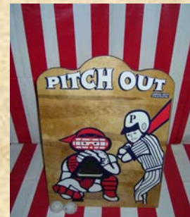
Pitch Out 37"h x 23"w x 9"d

Carnival Game complete with game board and 2 soft stuffed footballs. $195.00