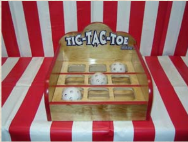
Tic-Tac-Toe 24"l x 24"w x 14"h Carnival Game complete with game box & 3 wiffle balls $195.00

Manufacturer of Quality Carnival Games & Supplies