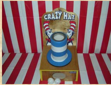
Crazy Hat 32" h x 17" w x 12" d Carnival Game complete with game & 2 whiffle baseball Price: $245.00