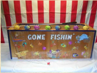
Gone Fishin' 18"h x 45"w x 16"d Carnival Game complete with game box 1 fishing pole, 1 horseshoe magnet and 24 non- floating puffer fish. Graphics on all four sides $365.00

Manufacturer of Quality Carnival Games & Supplies