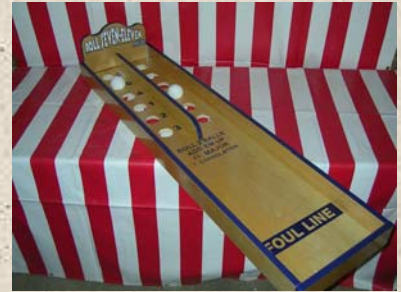
Seven-Eleven 10"h x 60"l x 13"w Carnival Game complete with game board and 6 rubber baseballs. $265.00