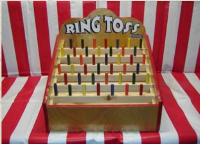
Ring Toss 24"w x 24"l x 24"h Carnival Game complete with game box, 42 colored pegs & 2 dozen rings $325.00