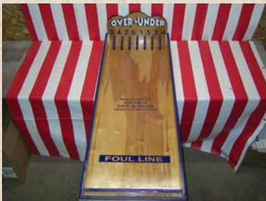
Over Under 62"l x 18"w x 6"h Carnival Game complete with game board & 6 balls $295.00