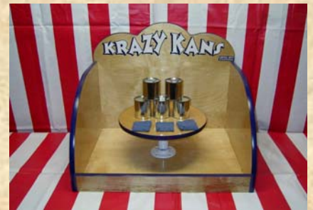
Krazy Kans 30'h x 27"w x 23"d

Carnival Game complete with game box, 36 Colored Plastic Bottles, 3 dozen 1 3/4" rings. $495.00