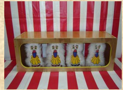
Down a Clown Knockdown Game Bottom Tier Carnival Game complete with 4-14" Clowns & 3 Flukey Balls $425.00