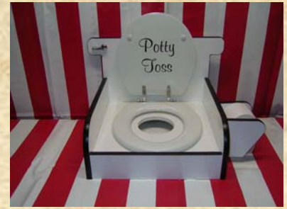
Potty Toss 24" l x 24" w x 14" h Carnival Game complete with game box & 3 wiffle balls $295.00