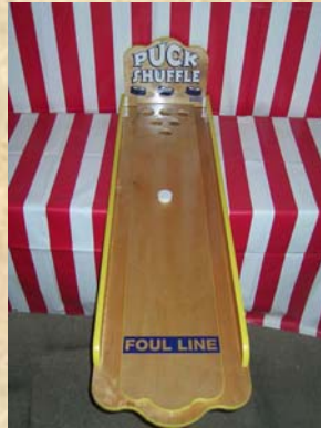
Puck Shuffle Game 74"l x 19"w x 12"h

Carnival Game complete with game board with stand and 3 whiffle softballs $195.00