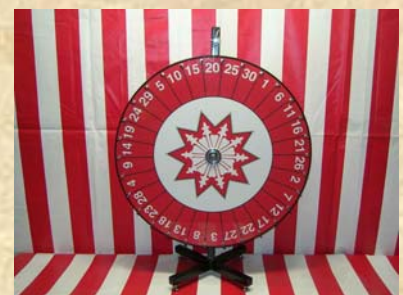
Carnival Game Wheels 24" $395.00 30" $450.00 36" $495.00 Standard models are 30 numbers per wheel