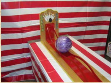
Roller Bowler 20'h x 12"w x 90"d

Manufacturer of Quality Carnival Games & Supplies