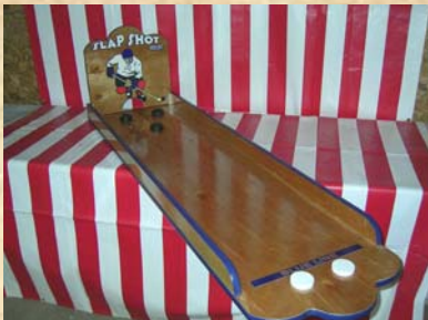
Slap Shot 18"h x 19"w x 70"l

Carnival Game complete game & 6 animated pigs. Requires 2"C" batteries per pig (not included) $445.00