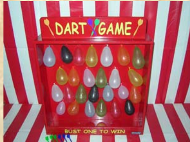
Dart Game 30" x 30"

Carnival Game complete with game box, pedestal, 2 milk bottles and 2 flukey balls $285.00