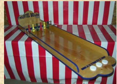
Shuffleboard 74"l x 19"w x 6"h

Carnival Game complete with game board & 4 balls $295.00