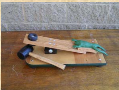
Launcher Heavy duty steel, oak, and birch base. $130.00