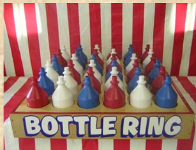
Bottle Ring Colored 36'l x 36"w x 13"h

Carnival Game complete with game box, 12 Colored Plastic Bottles, one dozen 1 3/4" rings for adult play & one dozen 7" hoopla rings for childs play. $245.00