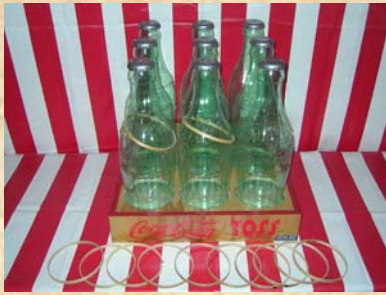
Coca-Cola Toss Game Box 24" x 24" Carnival Game complete with 9- 24" high Coke Bottles and 10 Wooden Hoops $225.00

Manufacturer of Quality Carnival Games & Supplies