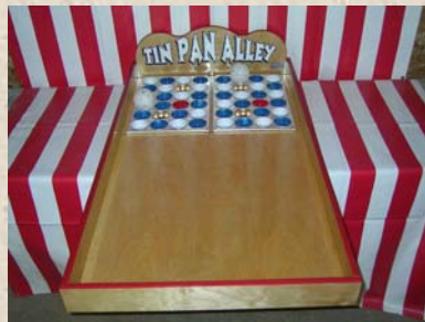
Tin Pan Alley 56"l x 35"w x 4"d Carnival Game complete with game board and 2 wiffle softballs $295.00