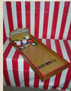
Win Lose Draw 48"l x 18"w x 6"h Carnival Game complete with gameboard & 3 wiffle balls $265.00