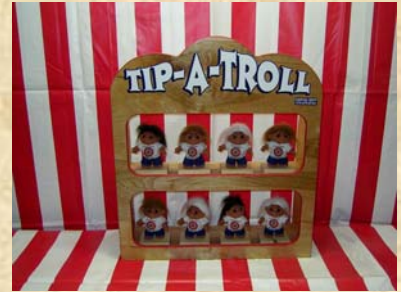
Tip a Troll 32"h x 28"w x 10"d

Carnival Game complete with game box and platform and 1 fishing pole. Bottle supplied by customer. $285.00