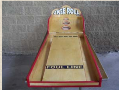
Skee Roll Ramp Section 48"l x 24"w x 4"h Back Section 24"l x 24"w x 19"h Carnival Game complete with two-section carnival game box & 3 wiffle balls $395.00