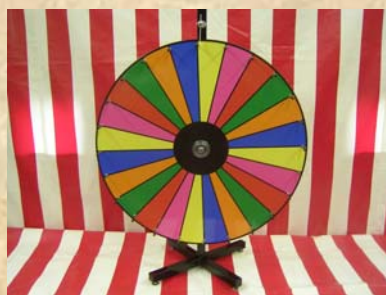
Color Dry Erase Wheels 24" $395.00 30" $450.00 36" $495.00 Standard models are 6 colors per wheel