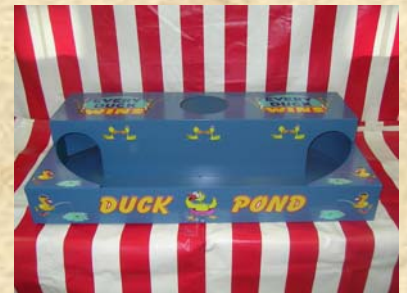
4' Duck Ponds Aluminum plate construction and powder coated paint. Submersible pump and 3 dozen roly poly ducks included Duck Pond Banner included $595.00