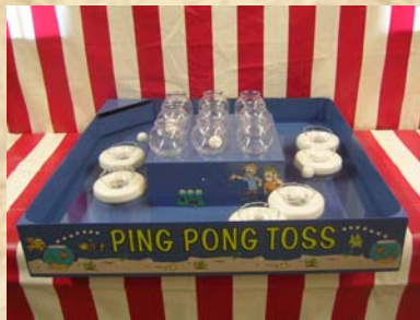
Ping Pong Toss 36"l x 36"w x 6"h Carnival Game complete with game box, 1 pump, 12 plastic fish bowls, 12 floating rings 12 nappy bowls and 12 ping pong balls. $695.00