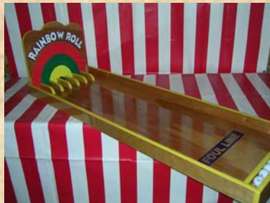
Rainbow Roll 62"l x 18"w x 6"h

Carnival Game complete with game board & 2 pucks $295.00