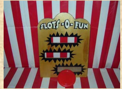
Slots-0-Fun 32"h x 11"d x 24"w Carnival Game complete with game board, support leg and 2 plastic frisbees. $265.00