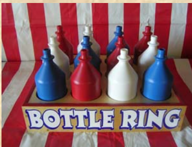
Bottle Ring Colored 21'l x 16"w x 13"h

32"h x 24"w x 13"d Carnival Game complete with game board and 3 bean bags $225.00