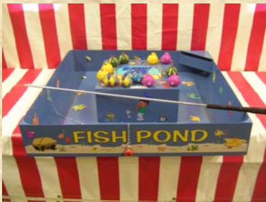
Fish Pond 36"l x 36"w x 6"h Carnival Game complete with game box, 1 pump, 2 fishing poles, 2 horseshoe magnets and 24 floating puffer fish. $695.00