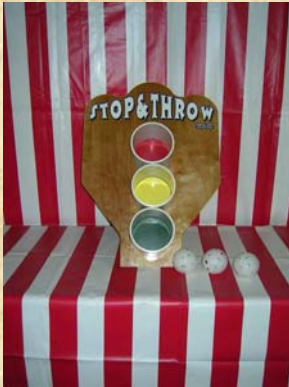
Stop and Throw 32"h x 18"w x 24"l

Carnival Game complete with game unit, 8 trolleys & 2 bean bags. $345.00