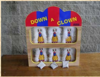
Mini Down -a -Clown 32" l x 28" w x 10" h Carnival Game complete with game board, 6- 11" clowns & 3 flukey balls $495.00