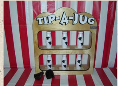
Tip a Jug 32"h x 28"w x 10"d Carnival Game complete with game unit, 6 painted milk bottles & 2 fluke balls $345.00